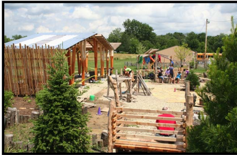
Nature Based Playground at TRC Muncie Head Start with Ball State University Architectural Students.